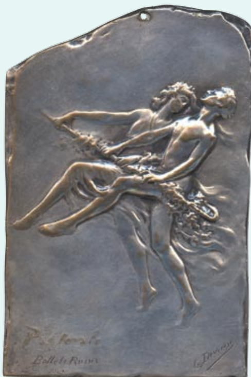
701 image reduced