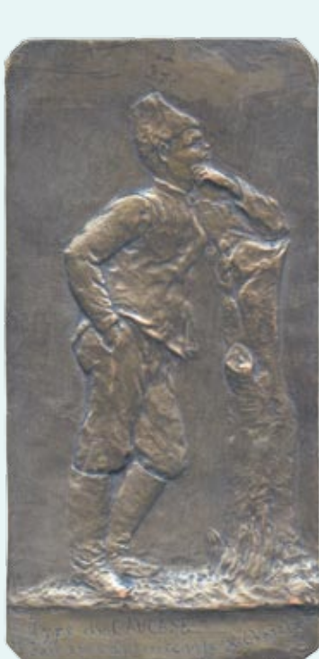
700 image reduced