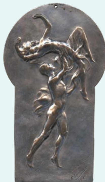
703 image reduced