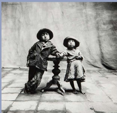
Irving Penn Cuzco Children , 1948, Gelatin silver print Provenance: A gift from Condé Nast to the present owner, 1973 Est. £8,000-12,000