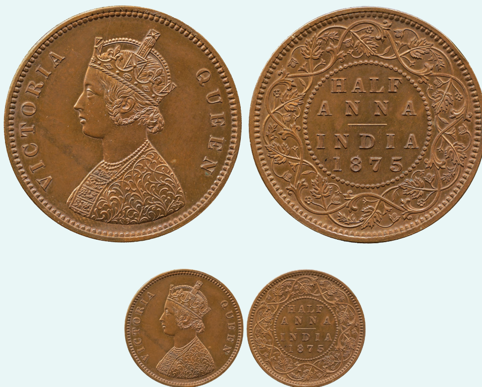
268 Copper Original Proof ½-Anna, 1875C, obverse B, obv VICTORIA QUEEN (SW 5.46). Nicely toned, choice uncirculated. £1000-1500