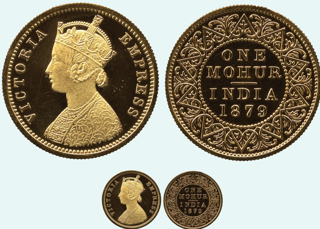
722 Gold Proof Restrike Mohur, 1879B, obv VICTORIA EMPRESS, young bust (SW 6.7). Gem proof with an amazing cameo from the frosted bust and proof fields. £4000-6000