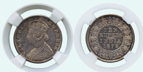
709 Silver Restrike 10-Rupees, 1879, off metal strike in silver, obv VICTORIA EMPRESS, mature bust (SW 6.22). In NGC holder, graded PF63, moderately toned and slightly overgraded. £1200-1500