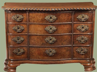
A fine George III mahogany and amarillo serpentine commode, circa 1760 Est. £30,000-50,000