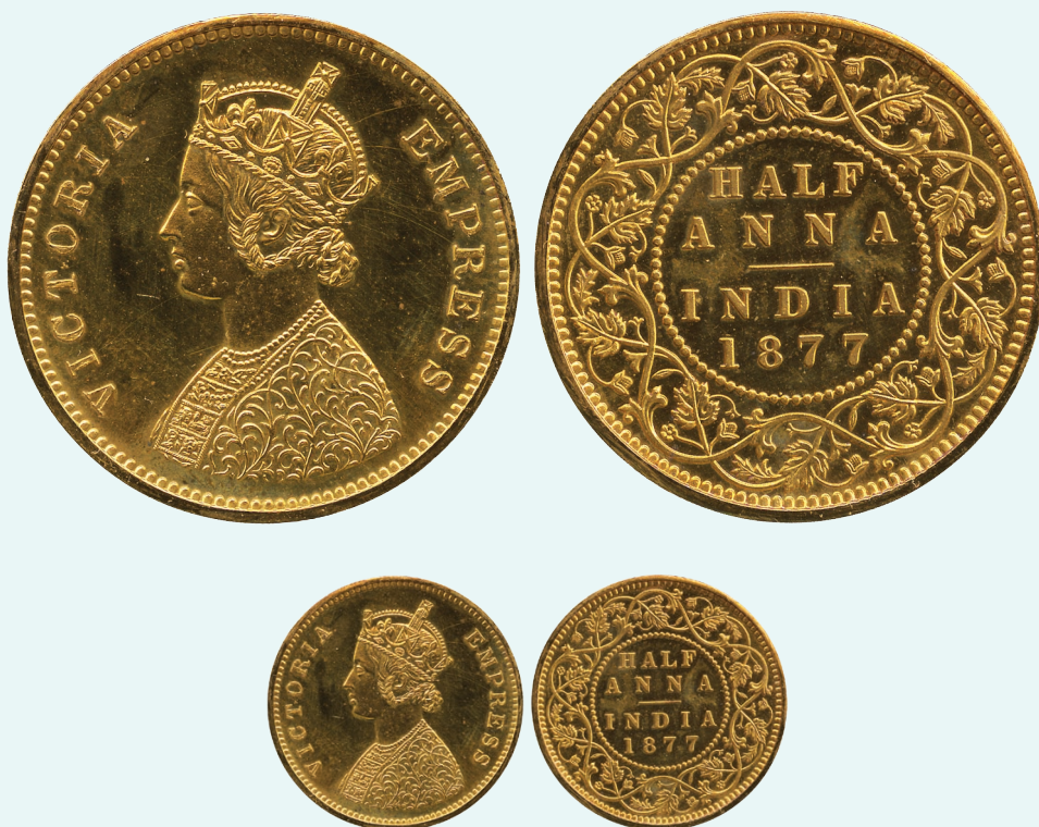
269 Gold Proof Restrike ½-Anna, 1877B, off-metal strike in gold, obverse B, obv VICTORIA EMPRESS (SW 6.460). Choice uncirculated. £3000-4000