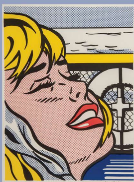
Roy Lichtenstein Shipboard Girl Off-set lithograph in colours, Signed in pencil Est. £10,000-15,000

Newbury Donnington Priory, Donnington RG14 2JE