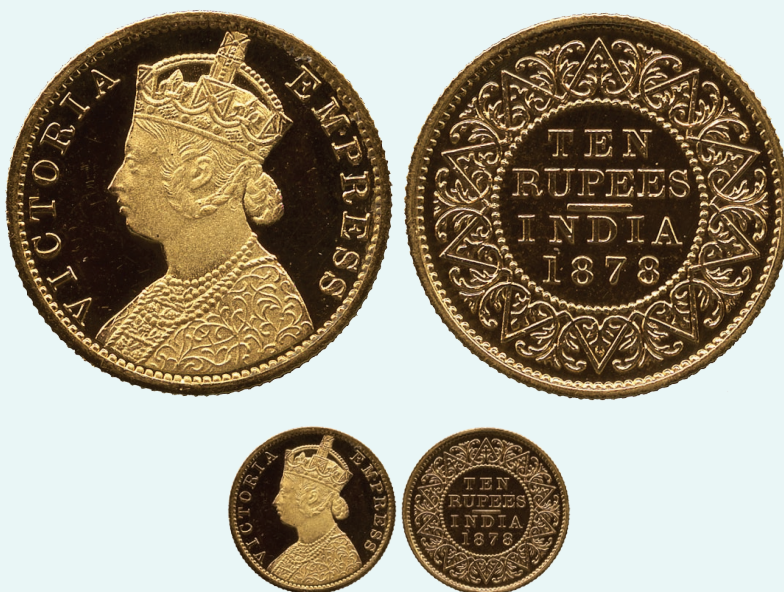
707 Gold Proof Restrike 10-Rupees, 1878C, obv VICTORIA EMPRESS (SW 6.20). Gem uncirculated with heavily frosted mature bust. £2000-2500