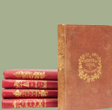
Charles Dickens The Christmas Books 5 vol., first editions, 1843-48 Est. £4,000-6,000