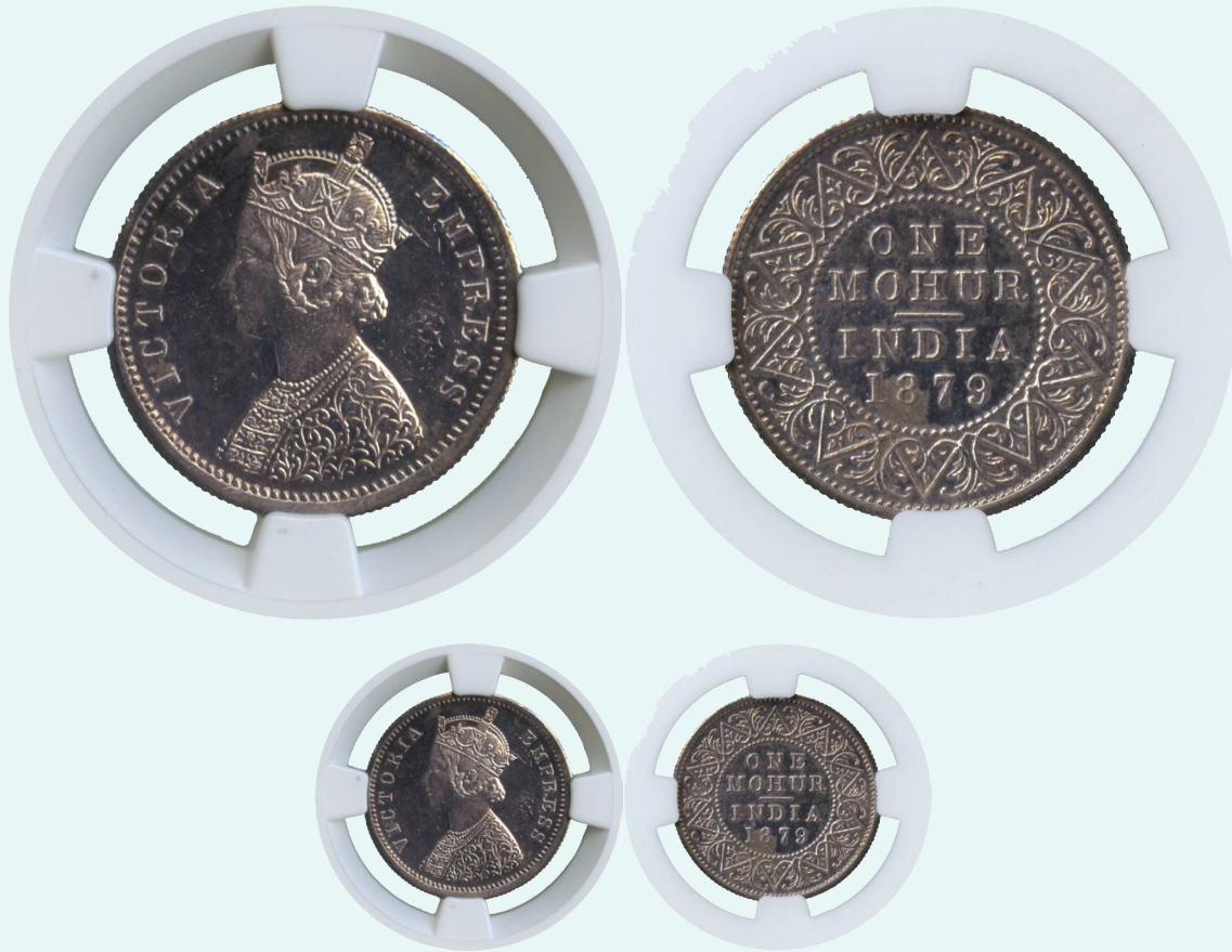
721 Silver Proof Mohur, 1879, off metal strike in silver, young bust pattern, obverse A, obv VICTORIA EMPRESS (SW 6.8). In NGC holder, graded PF62, moderately toned and correctly graded. £1200-1500