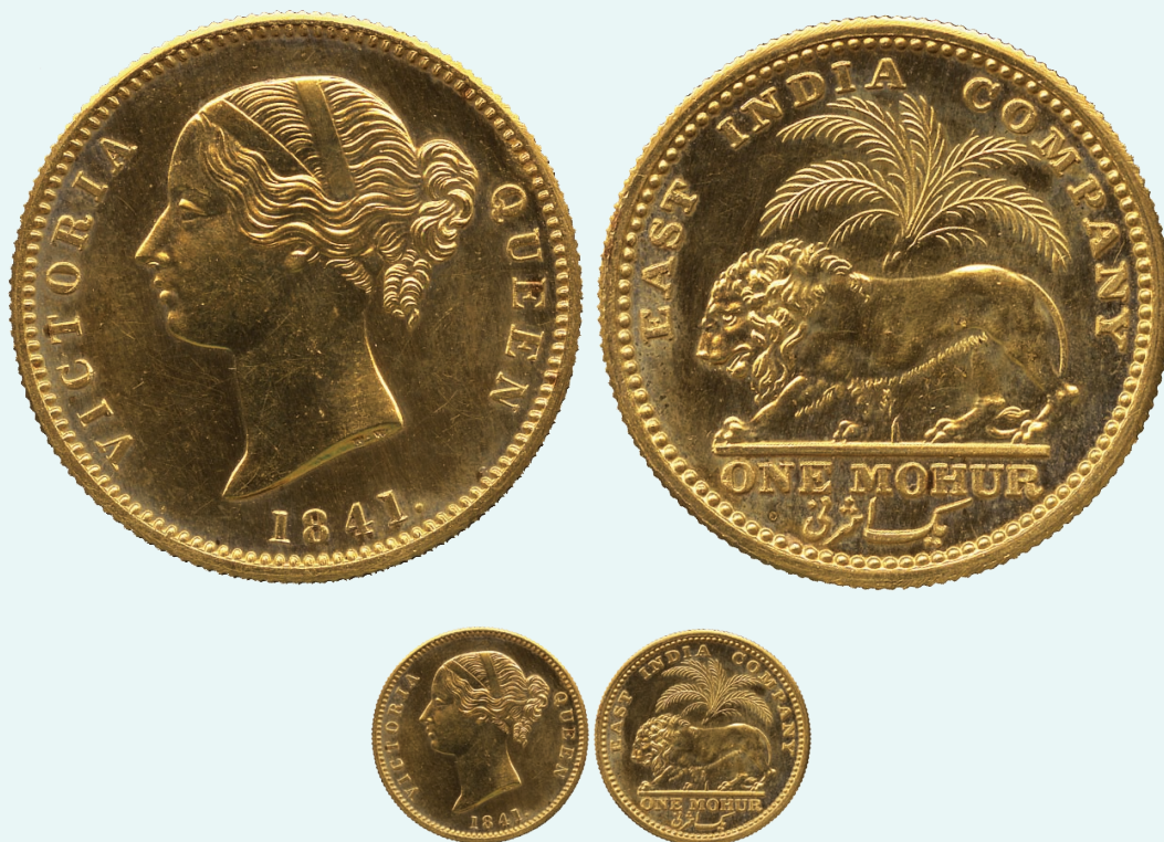
713 Gold Proof Restrike Mohur, 1841C, plain "4" in date, obv VICTORIA QUEEN, rev EAST INDIA COMPANY, earlier design with fuller vegetation (SW 3.9). Superb uncirculated . £1500-2000