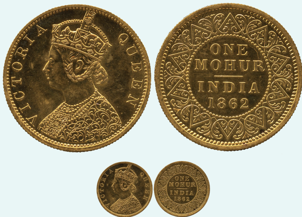
714 Gold Proof Restrike Mohur, 1862C, obv VICTORIA QUEEN, mature bust (SW 4.8). A little cloudy in part of the obverse field but choice uncirculated . £1500-2000