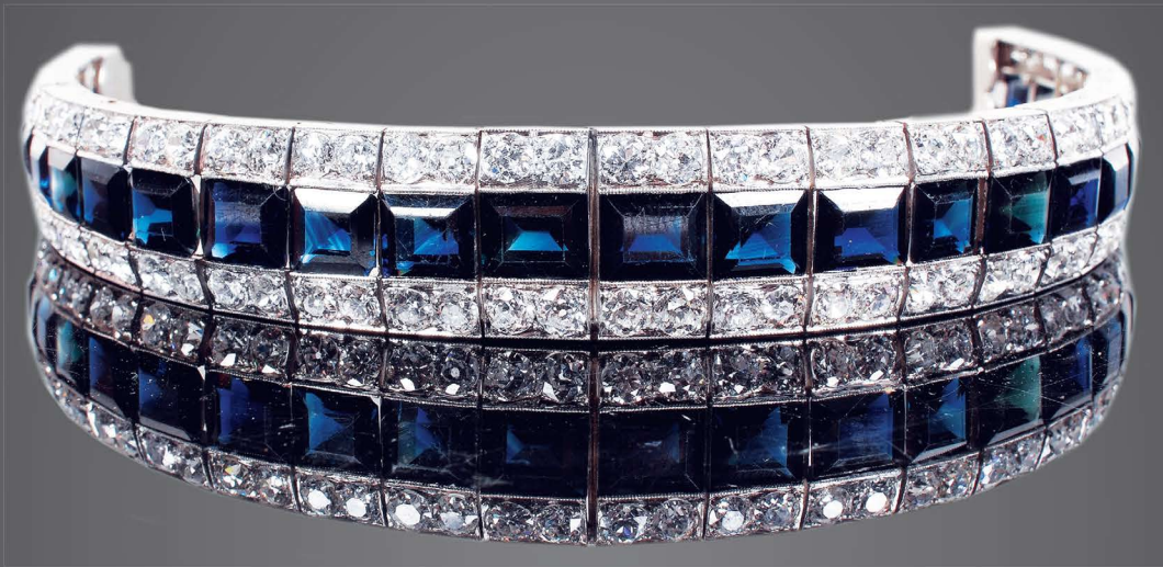
A French Art Deco sapphire and diamond bracelet by Laloche, circa 1925 Sold for £18,000

We are welcoming consignments into our busy sales calendar