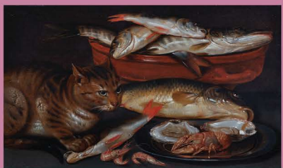
Clara Peeters Awaiting title Est. £20,000-30,000

Newbury Donnington Priory, Donnington RG14 2JE