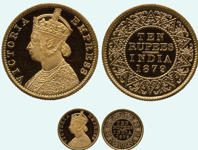
708 Gold Proof Restrike 10-Rupees, 1879C, obv VICTORIA EMPRESS (SW 6.21). Gem uncirculated with heavily frosted mature bust. £2000-2500