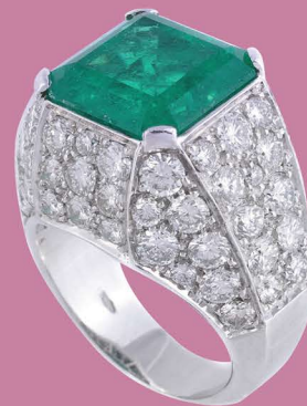
An emerald and diamond ring. Sold for £8,600 (March 2013)