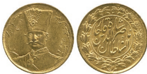
749 ₧ Nasir al-Din Shah , Gold Toman, 13[0]5h, 2.91g (KM 933). Extremely fine. £180-220