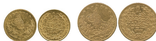
656 g Abdulaziz, Gold 25-Kurush, Qustantiniya 1277h, Year 11, 50-Kurush, Qustantiniya 1277h, Year 9 (KM 694, 695), Extremely fine and very fine. (2) £200-250