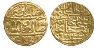
550 Selim II , Gold Sultani, Janja 974h, 3.39g (Pere 231). Good very fine. £350-400