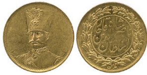
745 ₧ Nasir al-Din Shah , Gold Toman, 1297h, type without obverse legend, 2.86g (KM A932). Extremely fine. £200-250