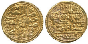
546 Selim II (974-982h) , Gold Sultani, Amid 974h, 3.49g (Pere 227). About extremely fine. £150-200