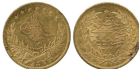
654 g Abdulaziz (1277-1293h), Gold 500-Kurush, Qustantiniya 1277h, Year 13, 36.03g (KM 698). About extremely fine. £800-1000