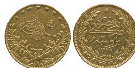
667 g Muhammad V , Gold 50-Kurush, Bursa 1327h, Year 1, commemorating visit to the mint, 3.59g (KM 788). Ex-mount and gilt, otherwise very fine and rare. £300-400