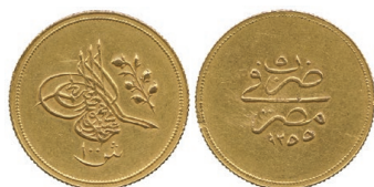
647 g Abdul Mejid, Gold 100-Qirsh, Misr 1255h, Year 5, 8.55g (KM 235.1). Edge marks at cardinal points, extremely fine with underlying lustre. £300-350