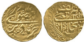
772 g 'Abd al-Ahad b. Muzaffer al-Din, Gold Tilla, 1309h, 4.54g (KM 65). Good very fine. £180-220