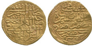
544 Sulayman I , Gold Sultani, Misr 935h, 3.41g (Pere 182 var). Good very fine, rare. £250-300