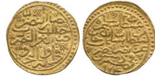
552 Selim II , Gold Sultani, Dimashq 974h, 3.45g (Pere 234). About extremely fine. £200-250