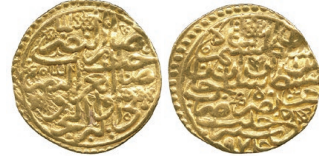
551 Selim II , Gold Sultani, Halab 974h, 3.44g (Pere 235). Good very fine. £120-150