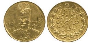
752 ₧ Nasir al-Din Shah , Gold Toman, 1311h, 2.85g (KM 937). Extremely fine. £200-250