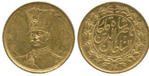
746 ₧ Nasir al-Din Shah , Gold Toman, 1297h, 2.89g (KM 933). Good extremely fine. £180-220