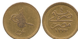
655 g Abdulaziz, Gold 100-Qirsh, Misr 1277h, Year 4, Paris mint, 8.49g (KM 264). Very fine and scarce. £300-400