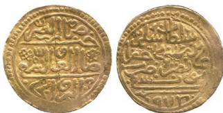
548 Selim II , Gold Sultani, Tunis 974h, 3.45g (Pere 246). Flan crack in centre and edges pared, otherwise very fine and very rare. £800-1000