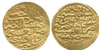
554 Selim II , Gold Sultani, Qustantiniya 974h, 3.44g (Pere 237). Extremely fine. £150-200