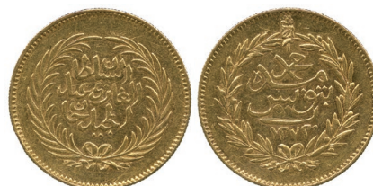
653 g Abdul Mejid / Muhammad Bey, Gold 50-Riyals, Tunus 1273h (KM127). Good very fine and scarce. £400-450