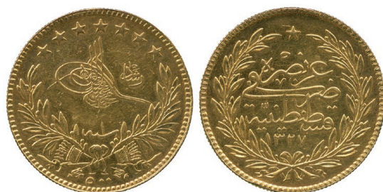
664 g Muhammad V (1327-1336h) , Gold 500-Kurush, Qustantiniya 1327h, Year 1, 35.94g (KM 758). Traces of mounting on edge at top, good very fine. £700-900