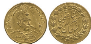
758 ₧ Muzaffar al-Din Shah , Gold Toman, 1321h, 2.77g (KM 995). About extremely fine. £120-150