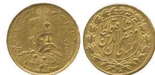
757 ₧ Muzaffar al-Din Shah , Gold Toman, 1318h, 2.81g (KM 995). Extremely fine. £120-150