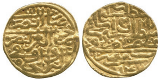
545 Sulayman I , Gold Sultani, Misr 942h, 3.44g (Pere 182 var). Very fine. £250-300