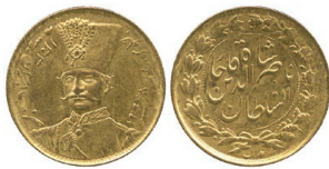
748 ₧ Nasir al-Din Shah , Gold Toman, 1303h, 2.84g (KM 933). Extremely fine. £180-220