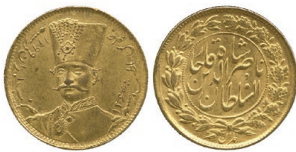
747 ₧ Nasir al-Din Shah , Gold Toman, 1299h, 2.82g (KM 933). Extremely fine. £180-220