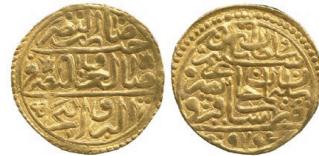
553 Selim II , Gold Sultani, Saqiz (Chios) 974h, 3.42g (Pere 241). Peripheral weakness at one side, good very fine. £250-300