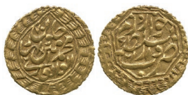
774 g Muhammad Amin (1261-1271h), Gold 1/2-Tilla, Dar al-Sultanate Khwarazm 1270h, 2.27g (KM C65a). Good very fine. £500-700