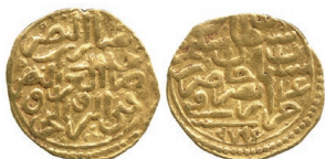
549 Selim II , Gold Sultani, Jazair 974h, 3.46g (Pere 232). Good very fine. £200-250