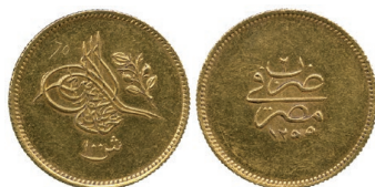
648 g Abdul Mejid, Gold 100-Qirsh, Misr 1255h, Year 6, 8.56g (KM 235.2). Faint hairline scratch to left on tughra, otherwise lustrous, good extremely fine. £300-350