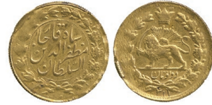
753 ₧ Nasir al-Din Shah , Gold Toman, Tehran 1311h, 2.81g (KM 989). Damaged edge, possibly ex-mount, very fine and rare. £350-400