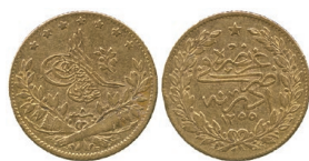
650 g Abdul Mejid, Gold 50-Kurush, Edirne 1255h, Year 8, commemorating visit to the mint, 3.56g (KM 682). Ex-mount, very fine. £200-250