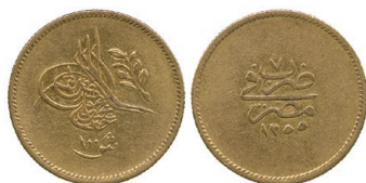
649 g Abdul Mejid, Gold 100-Qirsh, Misr 1255h, Year 7, 8.46g (KM 235.2). Very fine. £180-220