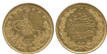
660 g Murad V (1293h) , Gold 100-Kurush, Qustantiniya 1293h, Year 1, 7.18g (KM 715). Extremely fine. £200-250