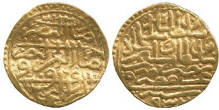
543 Sulayman I , Gold Sultani, Misr 932h, 3.50g (Pere 182 var). Good very fine. £250-300