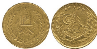
777 g Abdur Rahman (1297-1319h), Gold Tilla, 1316h, 4.59g (KM 822). Softly struck, otherwise extremely fine. £200-250