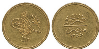
646 g Abdul Mejid, Gold 100-Qirsh, Misr 1255h, Year 3, 8.51g (KM 235.1). About extremely fine. £250-300