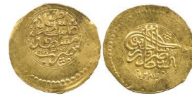
754 ₧ Nasir al-Din Shah , Gold ½-Toman, Mashhad 1284h, 1.62g (KM 863; A 2922). Good very fine. £200-250