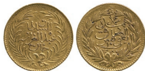
659 g Abdulaziz / Muhammad al-Saduq , Gold 10-Riyals, Tunus 1280h, 1.99g (KM150). Extremely fine. £120-150