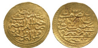
555 Murad III (982-1003h) , Gold Sultani, Misr 982h, 3.49g (Pere 273-274). Extremely fine. £150-200