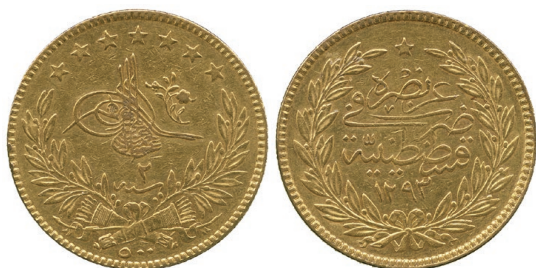
661 g Abdul Hamid II (1293-1327h) , Gold 500-Kurush, flower to right of toughra, Qustaniniya 1293h, Year 2, 35.98g (KM 727). Good very fine. £800-1000