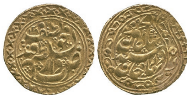
775 g Sayyid Sultan b. Malli (1280-1282h), Gold Tilla, 1280h, 4.45g (KM C145). Extremely fine. £350-400