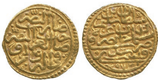
547 Selim II , Gold Sultani, Sidre Qapsi 974h, 3.49g (Pere 242). Good very fine. £200-250