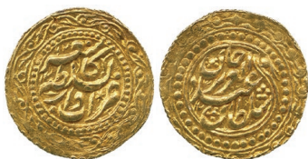
776 g Yaq'ub Beg, Gold Tilla, Kashgar 1292h, with the name of the Ottoman Sultan 'Abd al-'Aziz, 3.55g (KM C37-2.5). About extremely fine, rare. £600-800