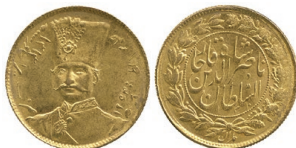
751 ₧ Nasir al-Din Shah , Gold Toman mule, 1313/1310h, 2.79g (KM 938). Extremely fine, rare. £350-400