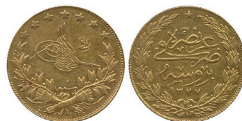
666 g Muhammad V , Gold 100-Kurush, Bursa 1327h, Year 1, commemorating visit to the mint, 7.19g (KM 789). Extremely fine. £600-800