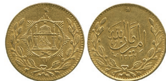
778 g Ananullah (1337-1348h), Gold Tilla, 1337h, 4.57g (KM 861.1). Extremely fine. £200-250