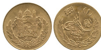
781 g Amanullah, Gold Amani, SH1304, Year 7, 5.98g (KM 912). Extremely fine. £200-250