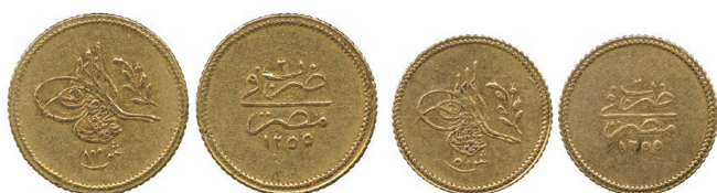
651 g Abdul Mejid, Gold 50-Qirsh and 100-Qirsh, Misr 1255h, Year 2, 4.23g, 8.48g (KM 234.1, 235.1). Both good very fine. (2) £400-500