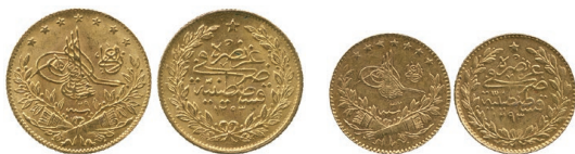
662 g Abdul Hamid II , Gold 25-Kurush, el-Ghazi type, Qustaniniya 1293h, Year 32, 50-Kurush, el-ghazi type, Qustaniniya 1293h, Year 29 (KM 729, 731). Both extremely fine. (2) £120-150