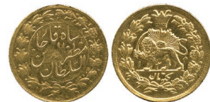
756 ₧ Muzaffar al-Din Shah , Gold Toman, 1314h, 2.92g (KM 988). Good extremely fine. £400-500