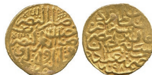
556 Murad III , Gold Sultani, Baghdad 982h, 3.49g (Pere 261). Good very fine, rare. £600-800