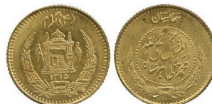
783 g Muhammad Zahir Shah (1352-1393h), 4-Grams, SH1315, 3.98g (KM 935). About extremely fine. £120-150