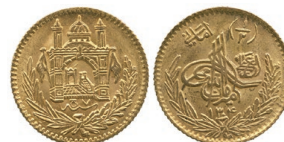
782 g Amanullah, Gold 1/2-Amani, SH1304, Year 7, 3.02g (KM 911). Extremely fine. £100-120