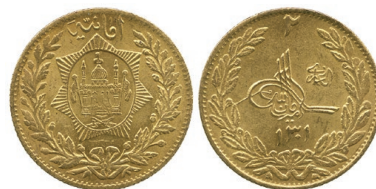
780 g Amanullah, Gold 2-Amanis, SH 1301, 9.22g (KM 888). Extremely fine. £200-250