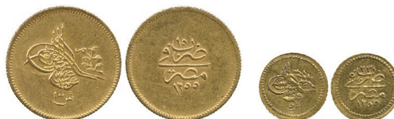
652 g Abdul Mejid, Gold 50-Qirsh and 100-Qirsh, Misr 1255h, Year 15, Gold 5-Qirsh, Misr 1255h, Year 23 (KM 234.2, 235.2, 230). Some marks, generally very fine. (3) £300-350