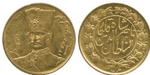
750 ₧ Nasir al-Din Shah , Gold Toman, 13[0]6h, 2.92g (KM 933). Extremely fine. £180-220