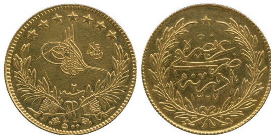
665 g Muhammad V , Gold 500-Kurush, Edirne 1327h, Year 2, commemorating visit to the mint, 36.00g (KM 795). Edge repaired at 12 o'clock, otherwise very fine. £3500-4000