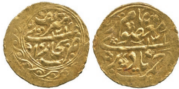
773 g 'Abd al-Ahad b. Muzaffer al-Din, Gold Tilla, 1319h, 4.55g (KM 65). Extremely fine. £200-250