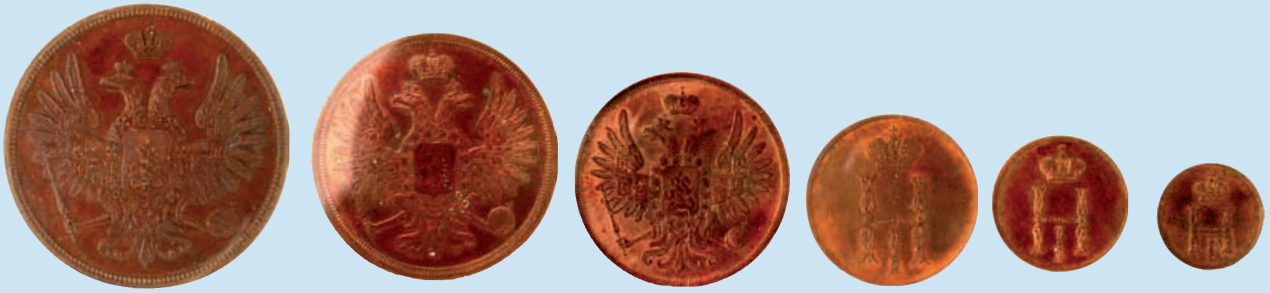
1273 Set of 6